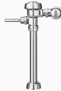
Variation Not Shown: Brushed Nickel